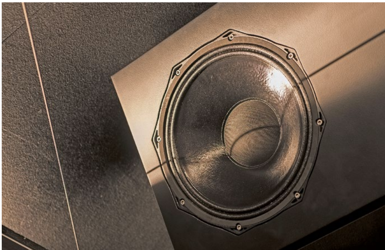
Functional yet beautiful – AIA loudspeakers come in a variety of shapes and sizes

When „The Jazz Singer“ marked the dawn of sound in movies back in 1927, more than just a few contemporaries saw it as the death of the young medium of moving pictures. But however despicable „Jazz Singer“ might have been on many levels, it started a revolution that spread quickly. Only a few years later silent movies were history, the future belonged to the 'Talkies'.